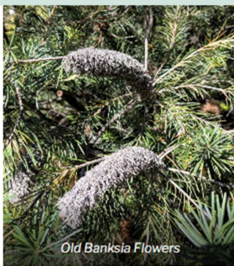
Old Banksia Flowers